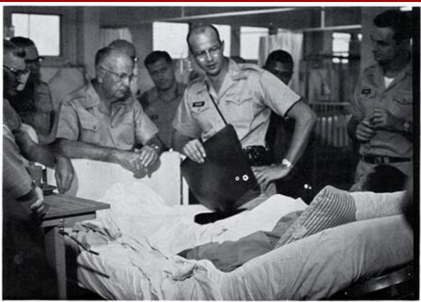
FIGURE 23.—General Heaton observed patient care at an Army hospital in South Vietnam during a visit in November 1967.

NASTY BOATS: Was several vessels built for the United States Navy and it was purchased for "unorthodox operations"