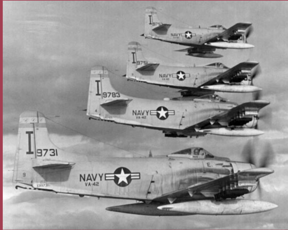
SKY RAIDER: They are airplanes that hold ammunition such as bombs.