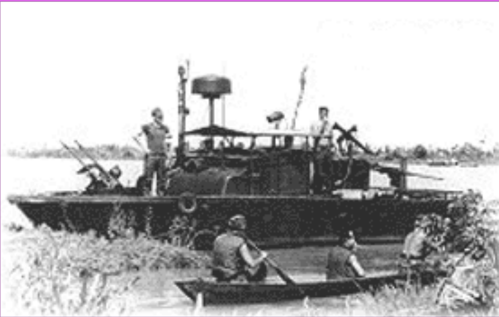
River patrol boats in Operation Game Warden

GAME WARDEN OPERATION: Was a joint operation conducted by the U.S. Navy and South Vietnamese Navy