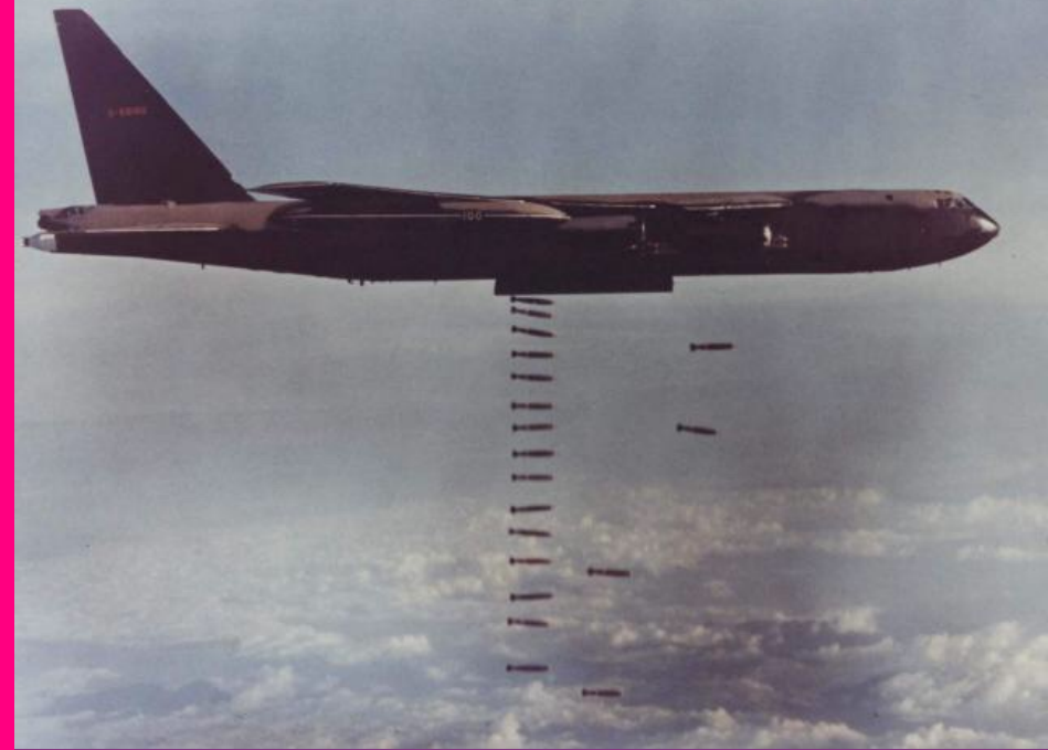
LINEBACKER OPERATION: Was a code name of the U.S. Seventh Air Force and U.S. Navy task force 77 campaign against the democratic republic of Vietnam