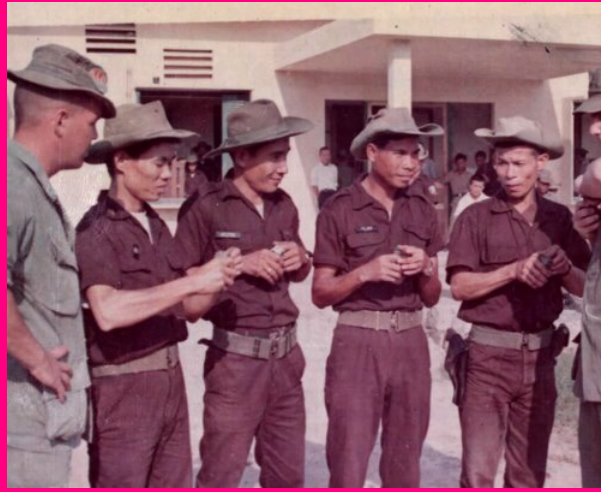
KIT CARSON SCOUT: Belonged to a program created by the U.S. Marine corps during the Vietnam War