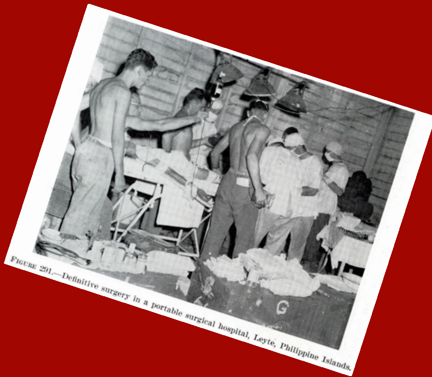
FIGURE 20.—Definitive surgery in a portable surgical hospital, Leyte, Philippine Islands.

MEDICAL EVALUATION: Medical back in Vietnam war was horrible, because now a lot of veterans have a variety of environmental and chemical hazards in their bodies that carried potential health risks