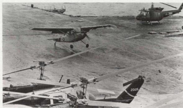
A Cessna O-1 Bird Dog lands on the USS Midway without benefit of a tailhook or barricade. The pilot, a Vietnamese major, brought with him his wife and five children.

EAGLE PULL OPERATION: Was the United States military evacuation by air in Phompenh, Cambodia on April 12, 1975